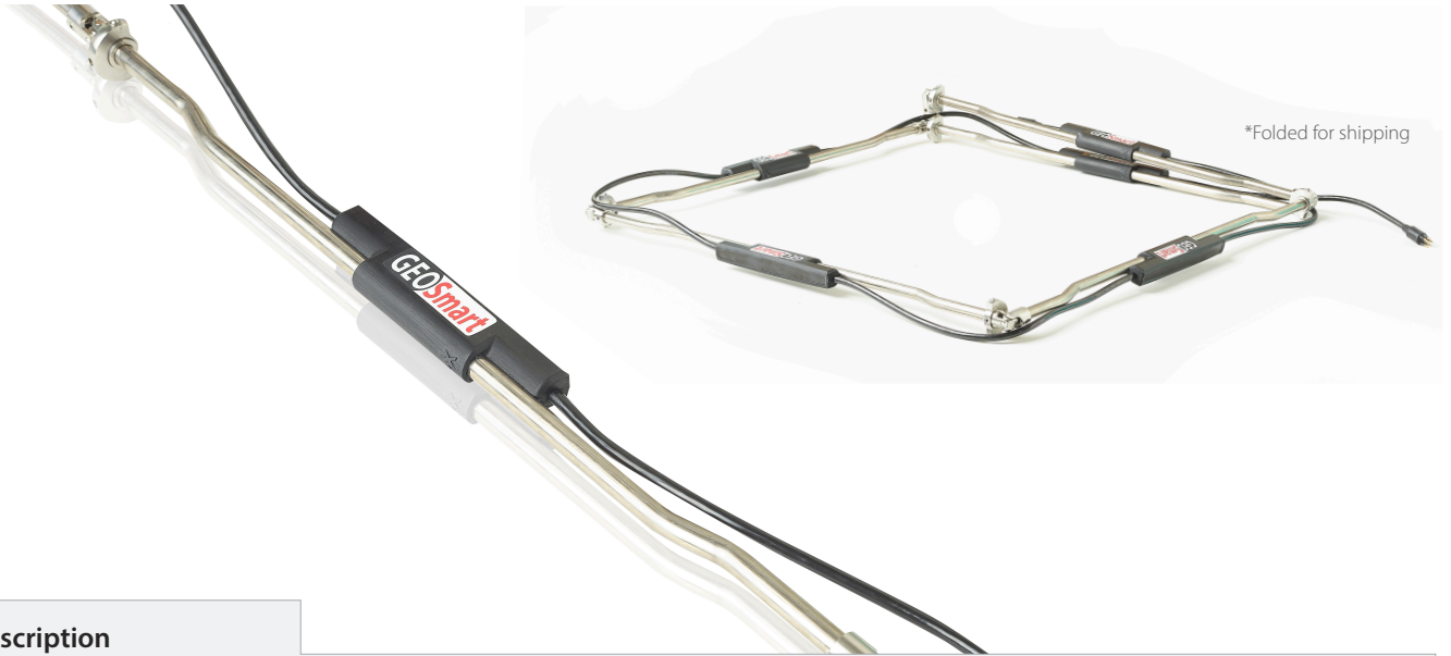
*Folded for shipping